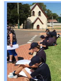
Year 7/8 Art Excursion