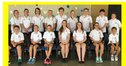
2017 Student Council